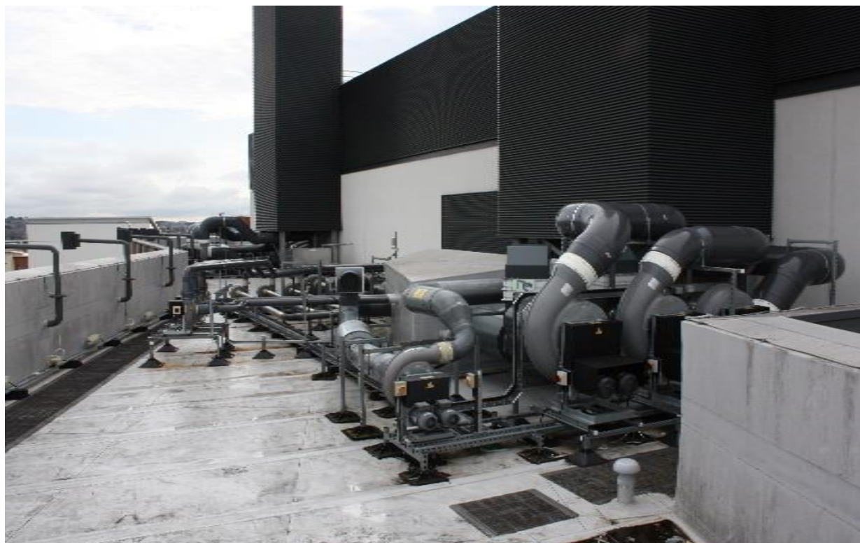
PVC Fume extraction systems to serve fume cupboards